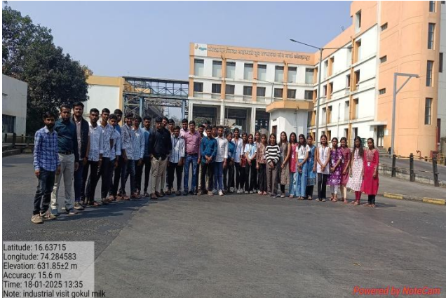
Entrance of the Gokul Milk