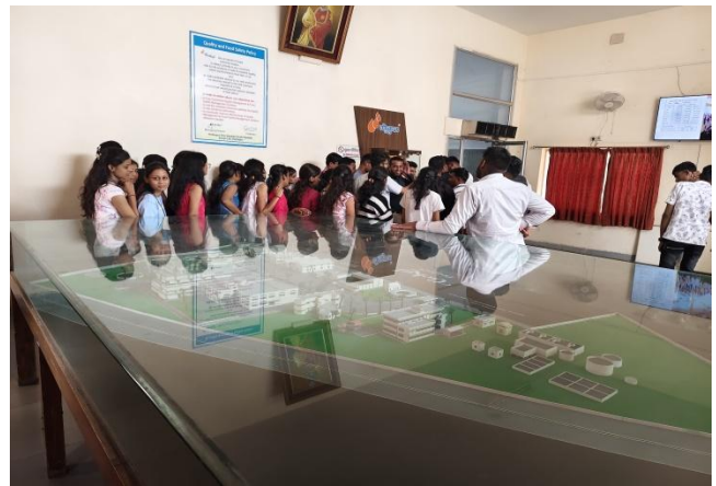
Question and Answer Session