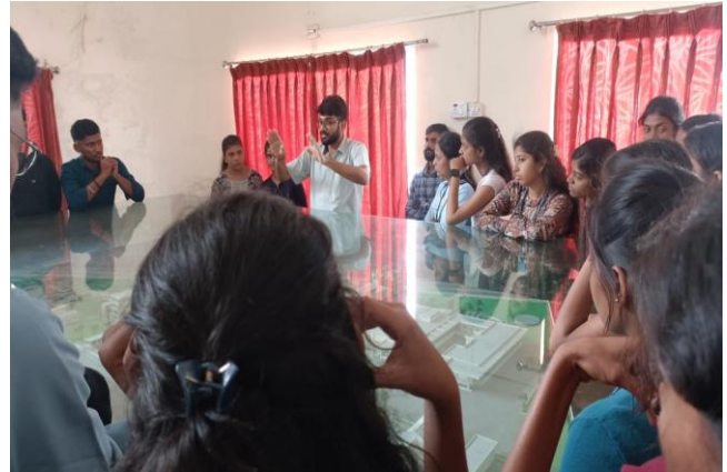
Shift Manager explaining about the operations