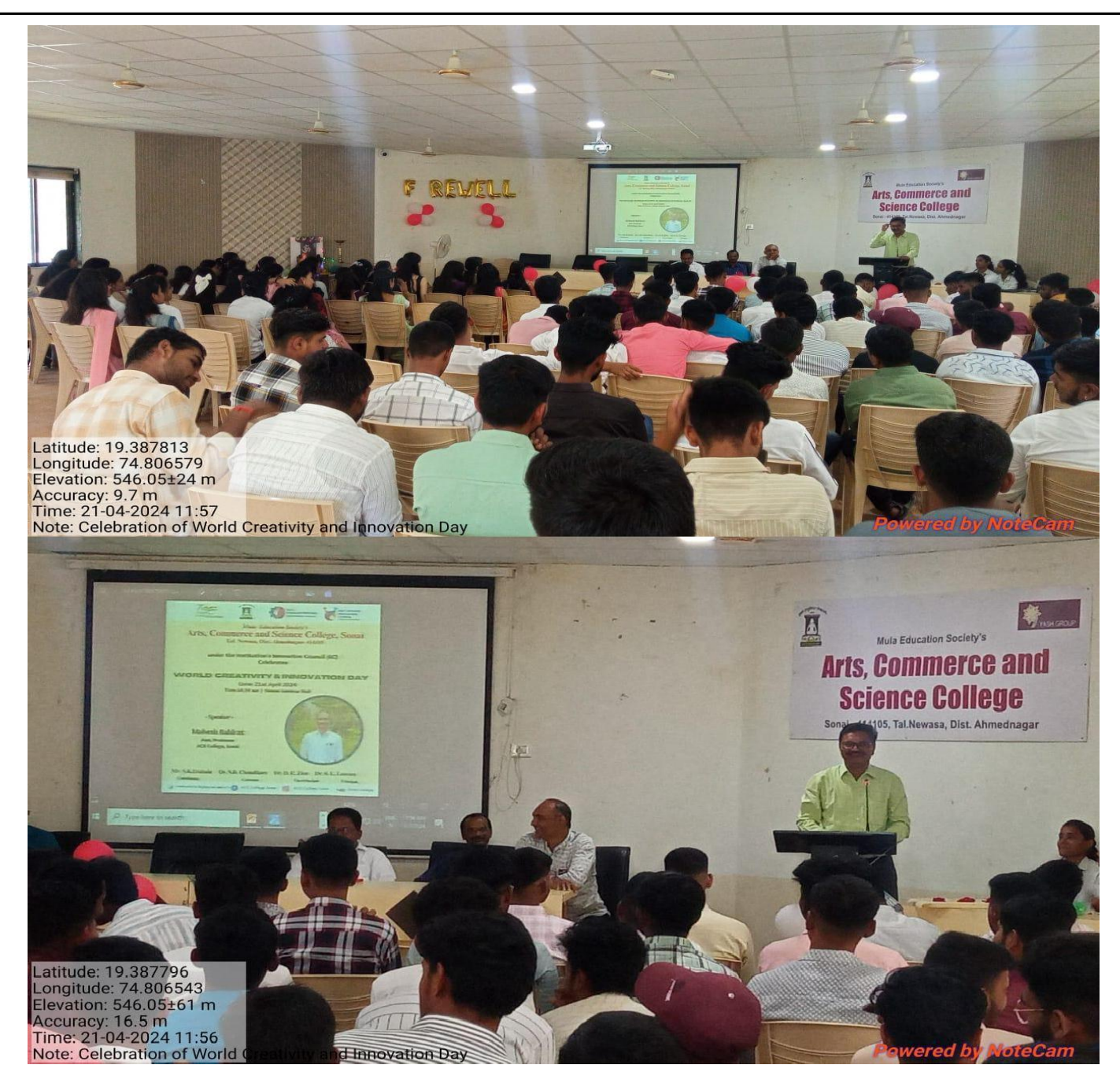
PRINCIPAL Mula Education Society's Arts,Commerce & Science College,Sonai Tal Newasa,Dist,Ahmednagar