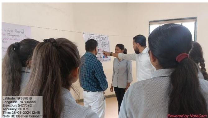
Photo 3 Student presenting their idea to experts