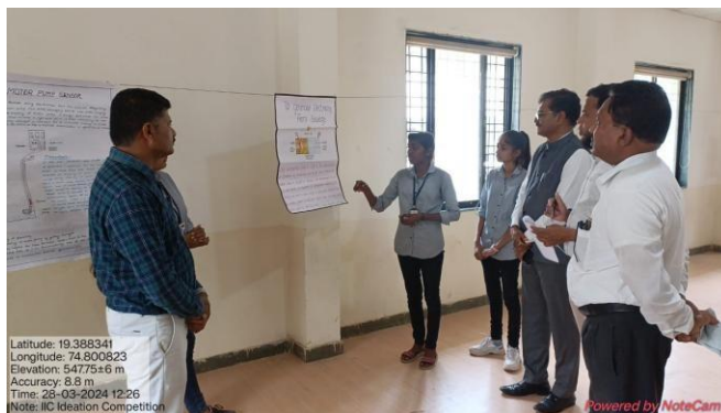
Photo 4 Teachers & Students viewing ideas