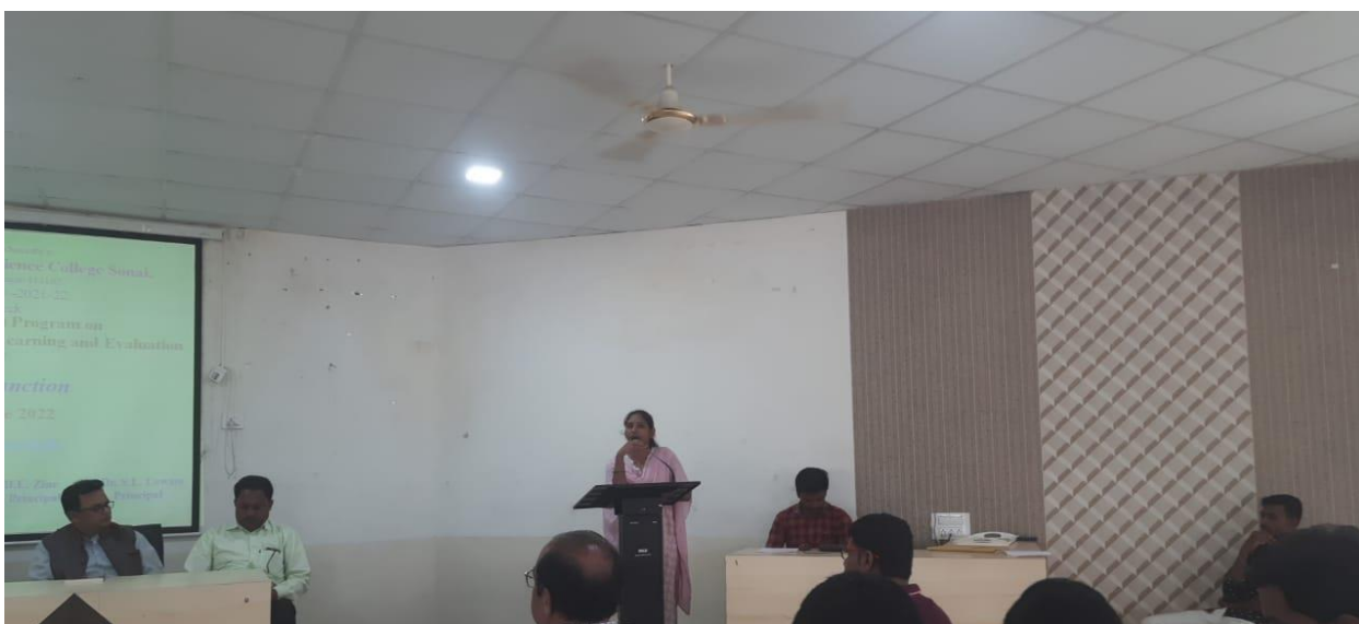
Photo 3 Participated teacher giving feedback during valedictory function