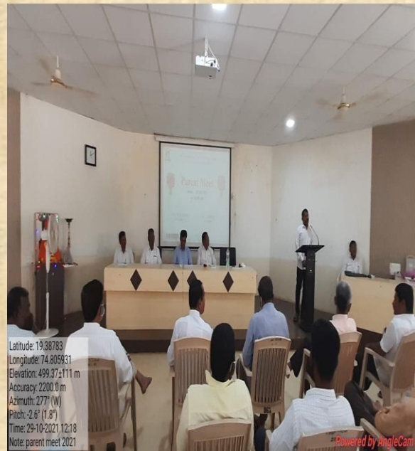
Parent expressing his thought