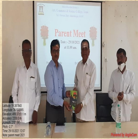
Felicitation of Chief Guest