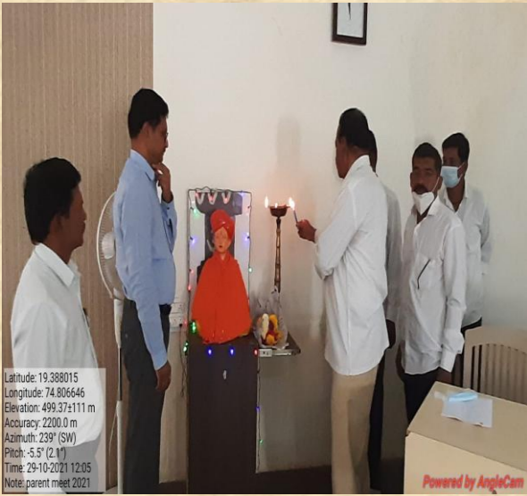
Parent meeting Inauguration Function