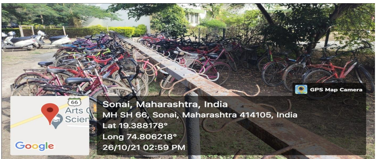
Use of Bicycles