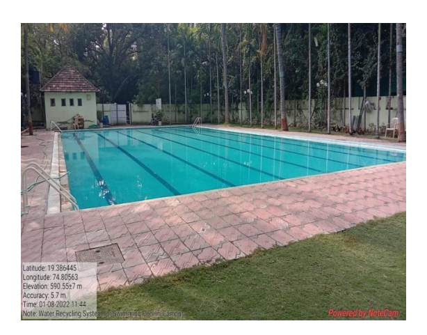
Waste water recycling