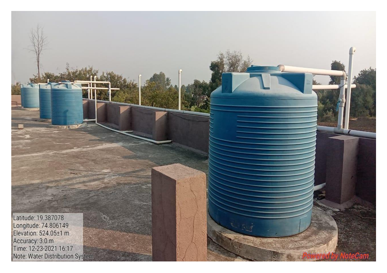
Water distribution system in the campus