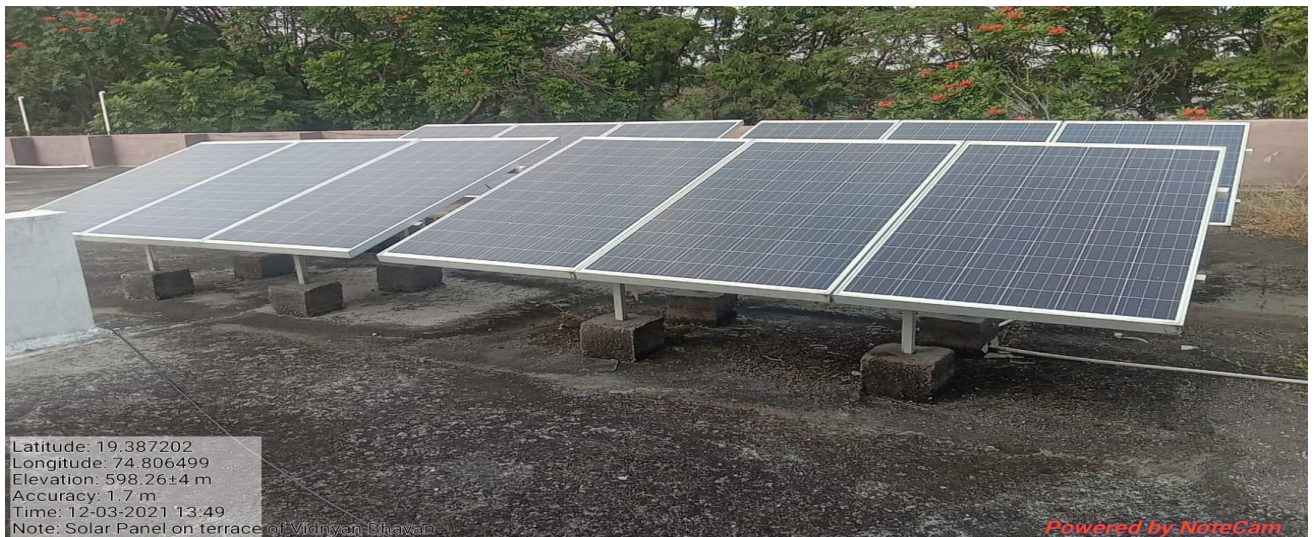
Solar Panels – VidnyanBhawan Building

Geo tagged photographs with captions and date: