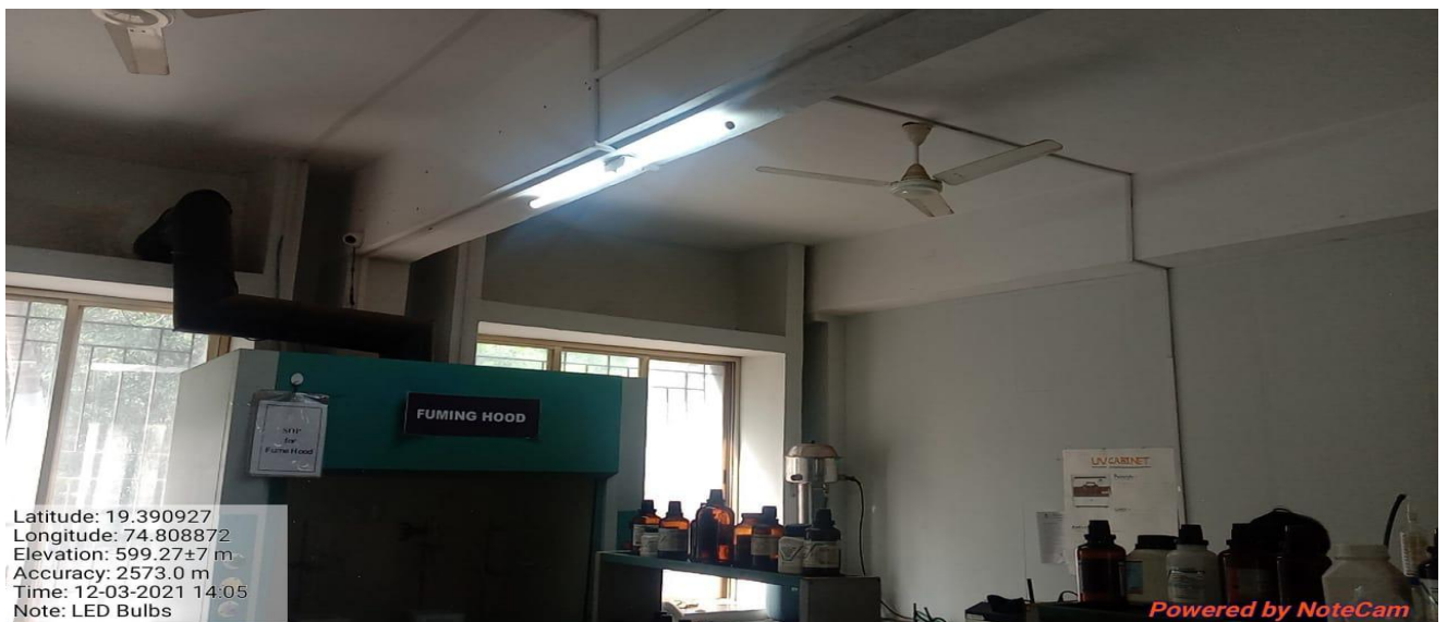
LED Lights – Chemistry Lab