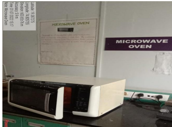
Sensor-based energy conservation