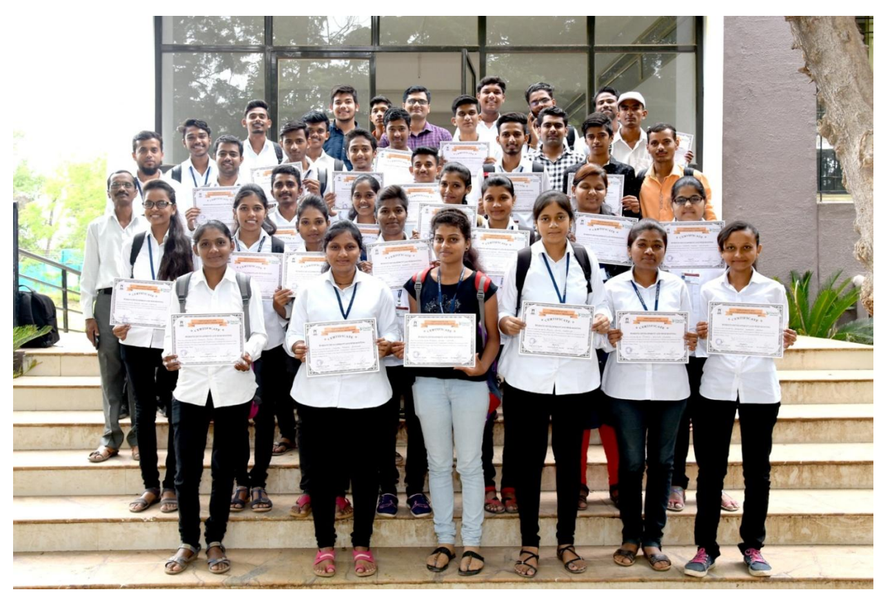
Workshop on Employment & Self Employment with Website development & Web Hosting