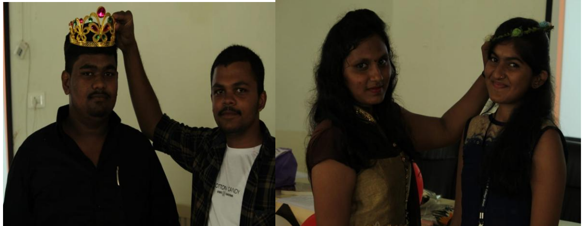
Mr. & Miss Fresher 2019

Students Achievement: (Provide details regarding the achievement) Photos/ Paper cuttings/ Certificate/ etc. may also be provided for the magazine