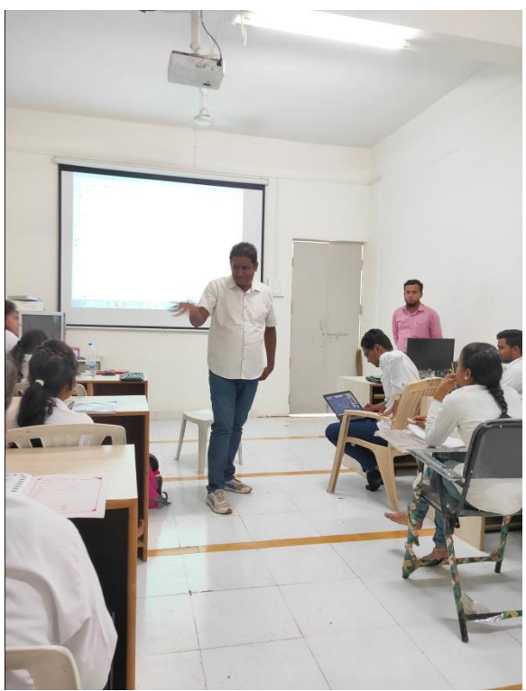
Workshop on VB based Project