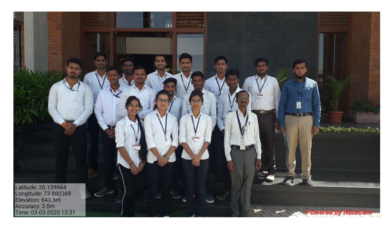
TYBBA students Industry visited atSahyadri Farmers Producer Co. Limited' Nashik on 03<sup>rd</sup> March 2020