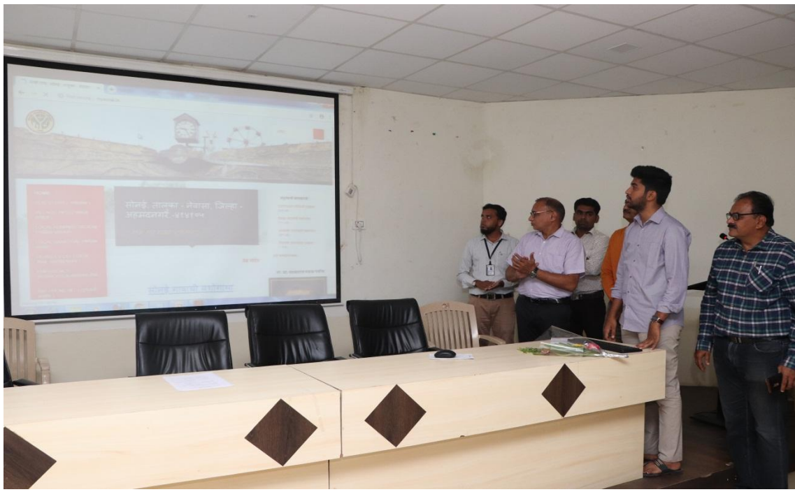
Inaugural Ceremony of Smart Village Website & various startup projects