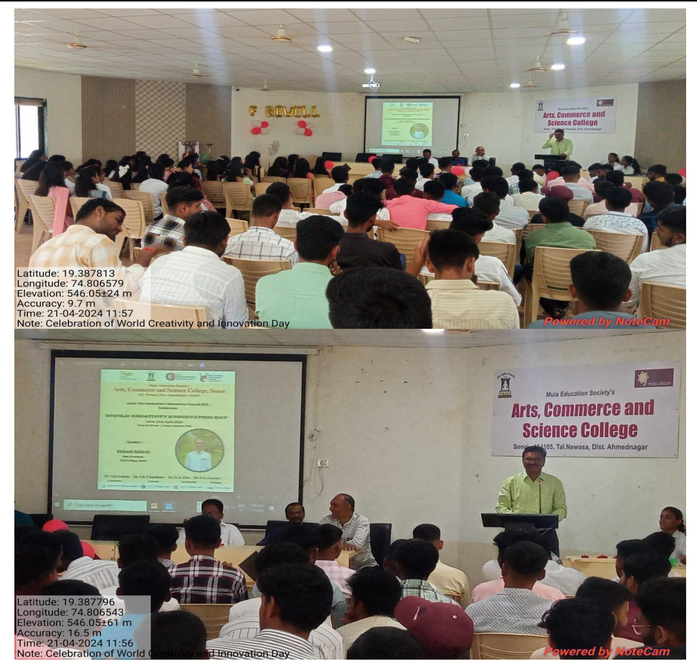
PRINCIPAL Mula Education Society's Arts,Commerce & Science College,Sonai Tal.Newasa,Dist.Ahmednagar

Mula Education Society's Arts, Commerce & Science College, Sonai. Institution's Innovation Council (IIC)