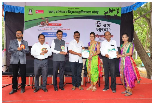
Chief Guest interacting with students