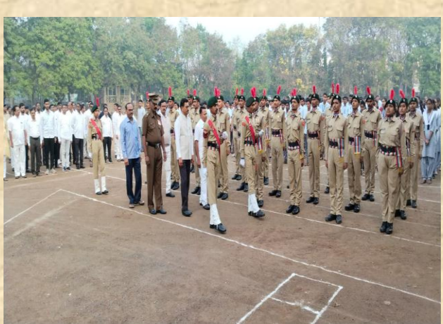
NCC Platoon observation