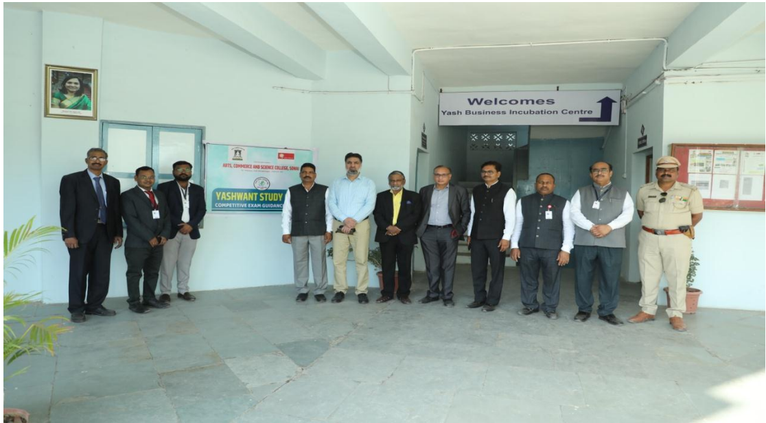
In Front of YBIC, with the Hon'ble NAAC Peer Team Member