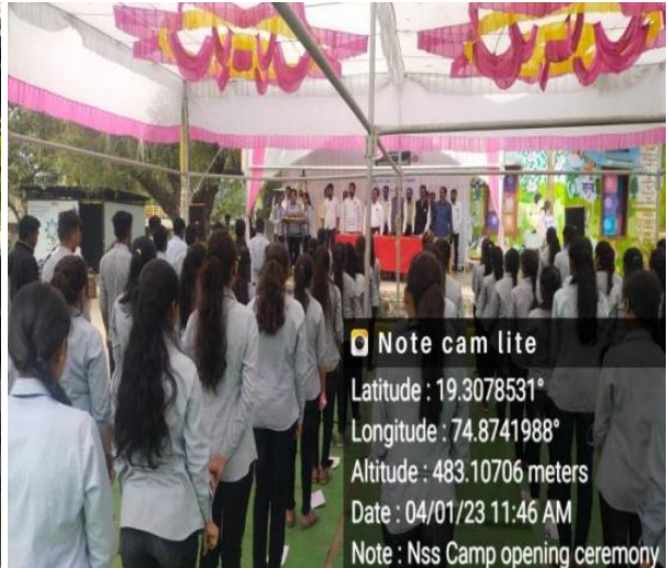
During the opening ceremony of the special winter camp, N.S.S Students volunteers performing NSS songs