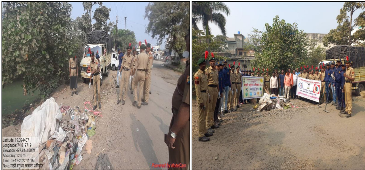
Garbage And Plastics were Collected by the N.C.C Cadets at. Kautiki River bank Sonai