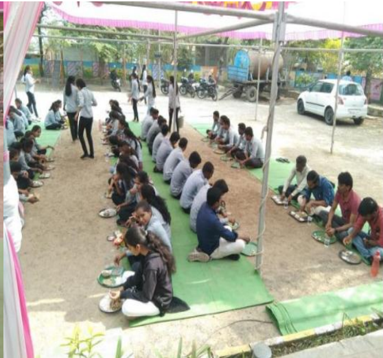
Students volunteer during lunch