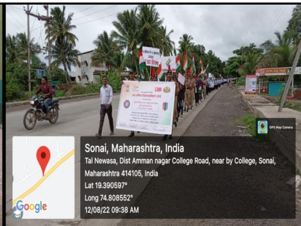
Har Ghar Tiranga Rally by NCC Cadets