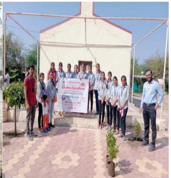
Students and program officers during village cleaning and tree planting