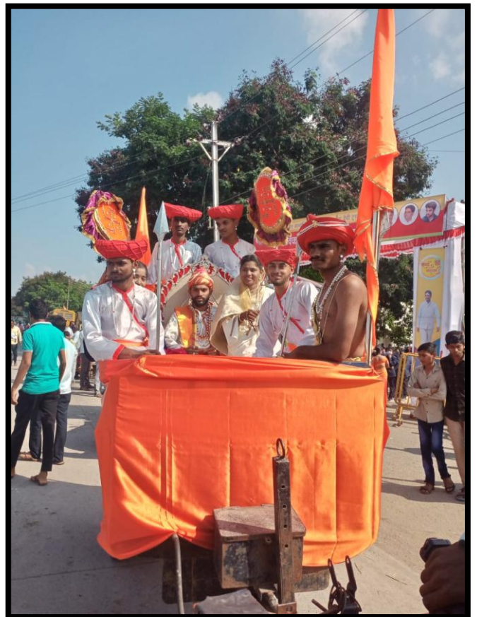
Chitrarath Activity held on 23 Oct 2022