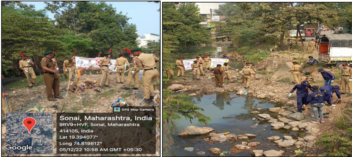
Cleanliness work at Kautiki River by N.C.C Cadets