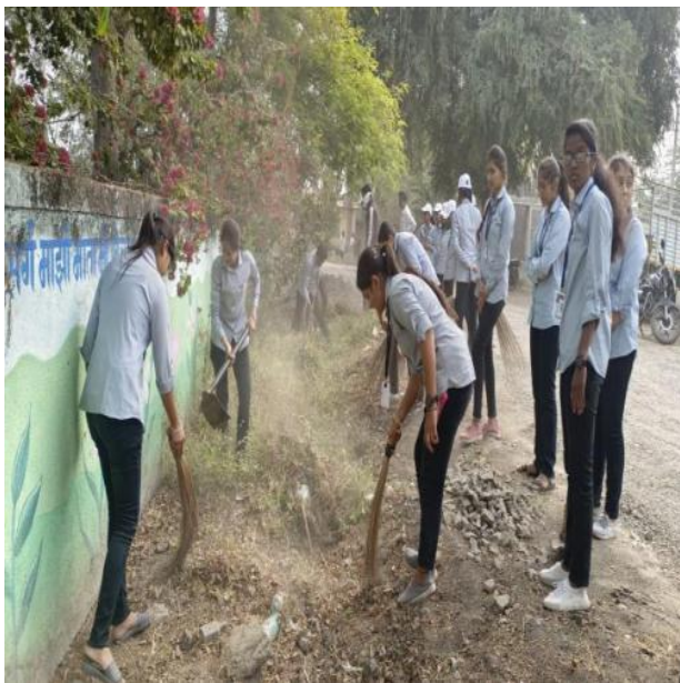
Students volunteer during cleaning