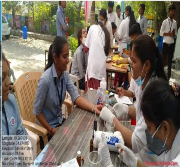
Dental care and hemoglobin testing