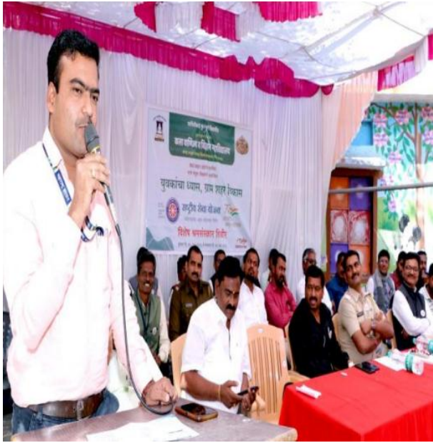
Special Winter Camp Concluding Guidance