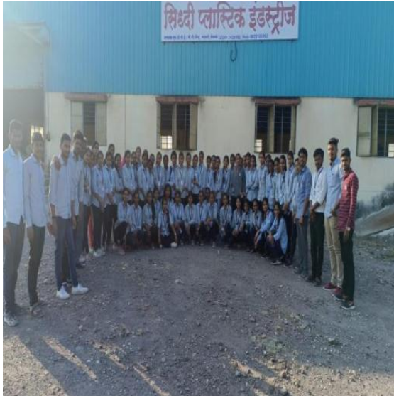
Visit to Power "Light and Siddhi Plastic" company