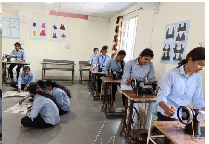
Photographs (Students Practicing)

PRINCIPAL Mula Education Society's Arts, Commerce & Science College, Tal. Newasa, Dist. Ahmednagar Pin 414105