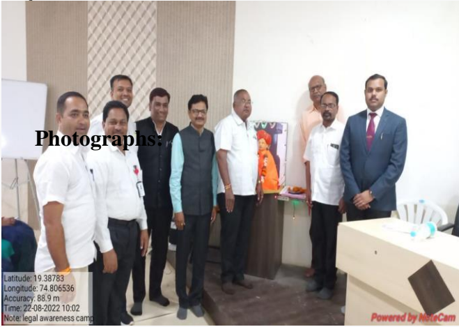
Inauguration of Legal Awareness Camp