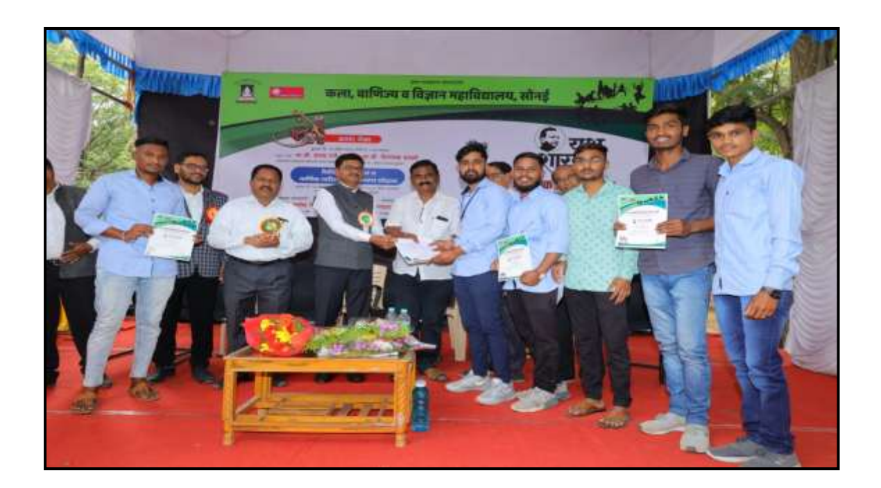
Prize Distribution in Annual Gathering