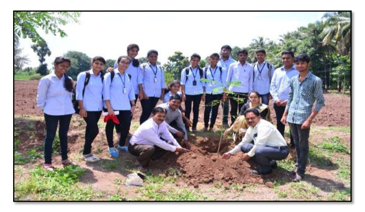
Tree Plantation on Ganesh Festival in College