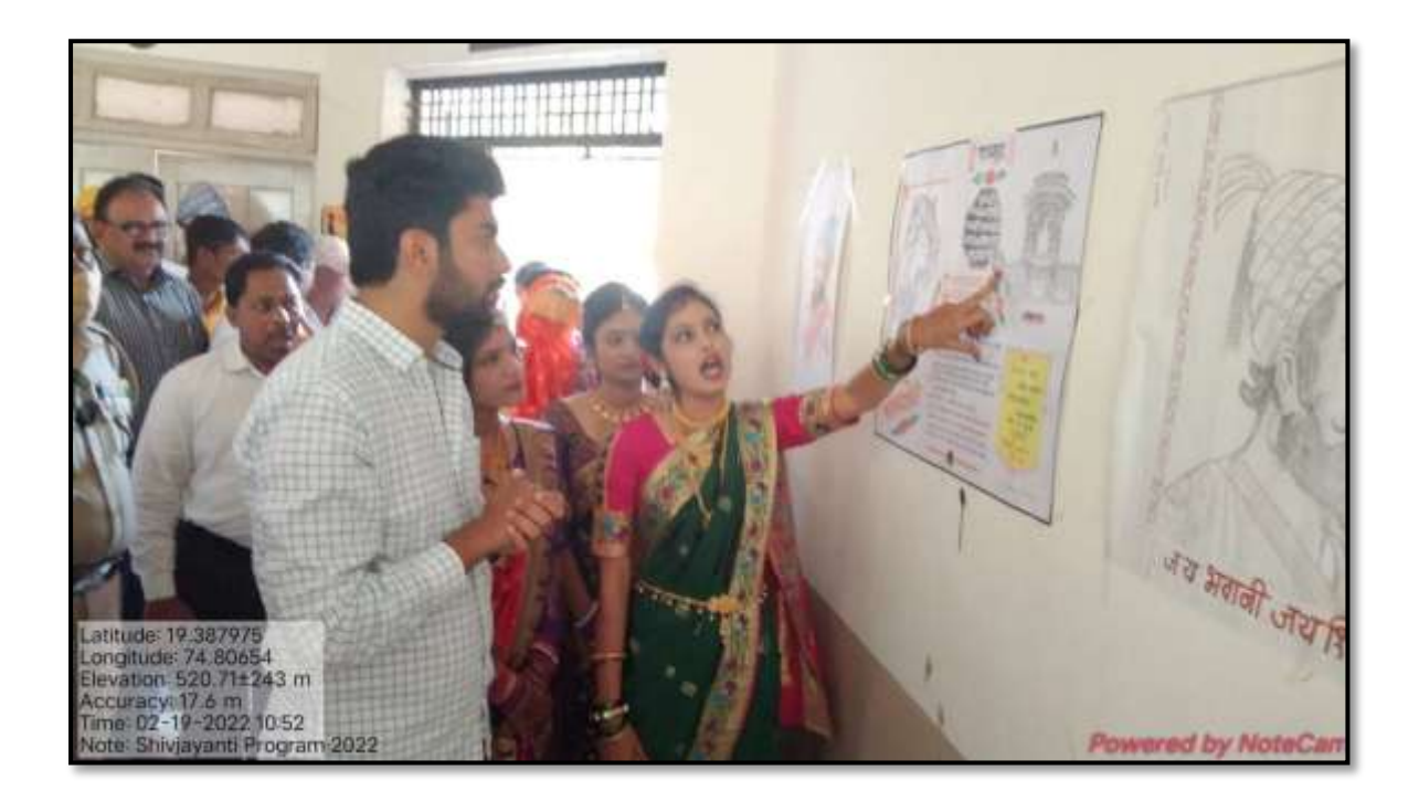
Poster Presentation competition on Shiv-JayantiUtsav