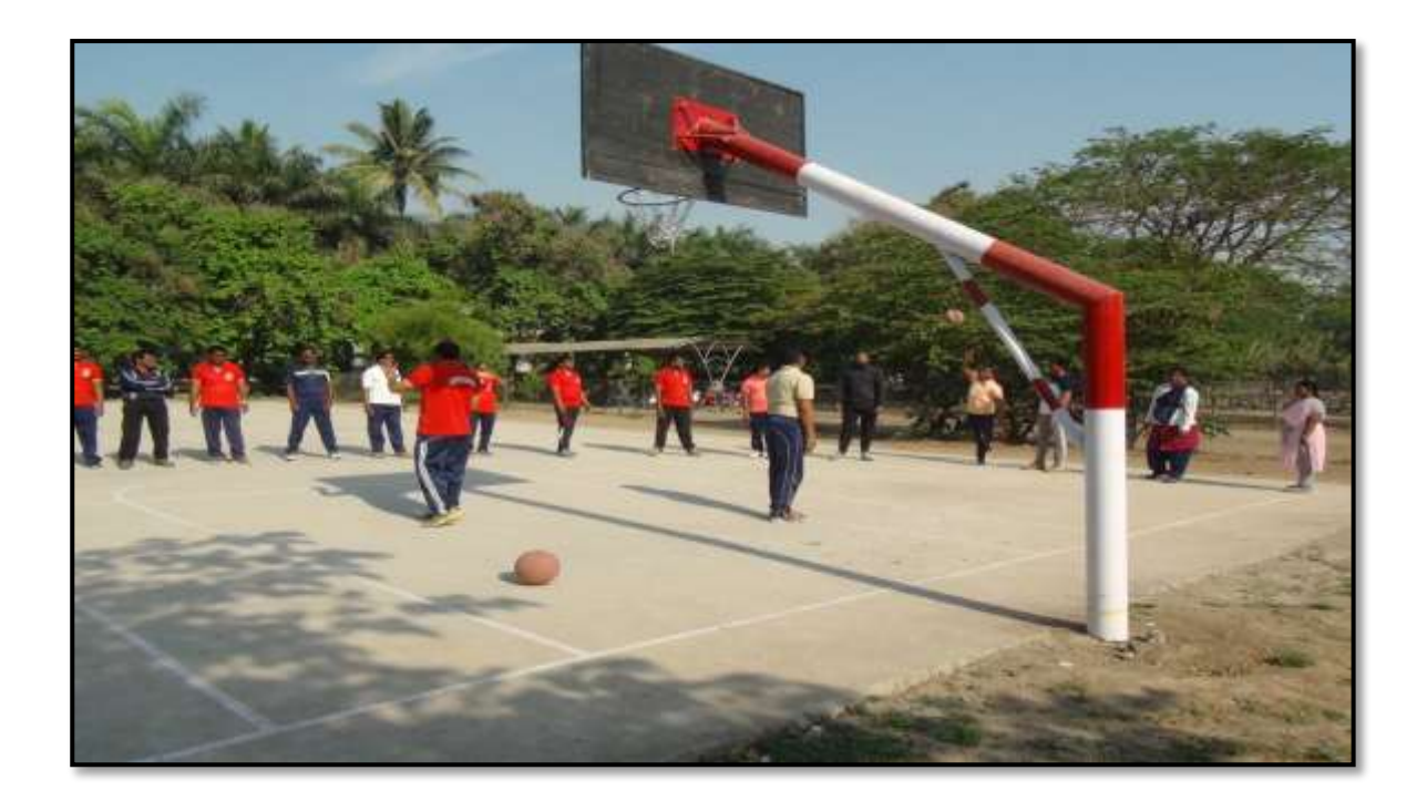
Students Playing Basket Ball