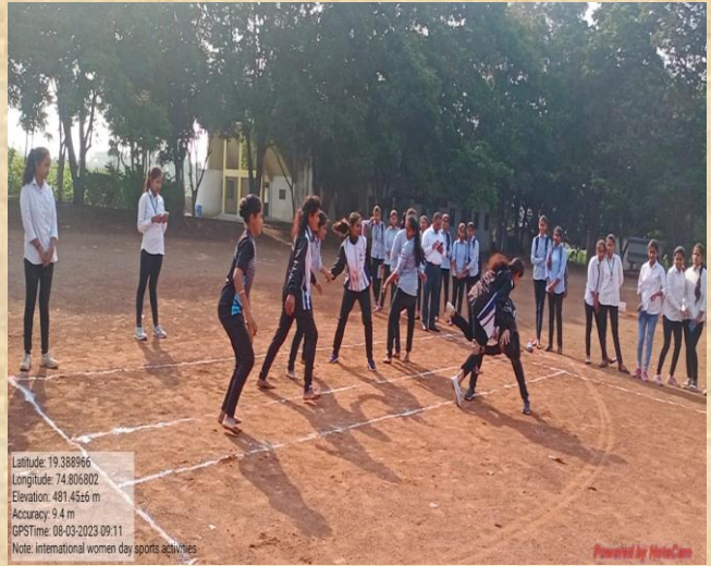
Kabaddi Competition Date: 8/03/2023