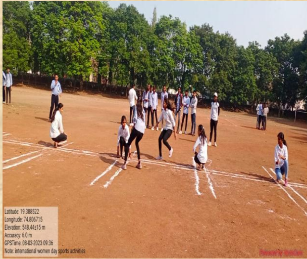
Kho- Kho Competition