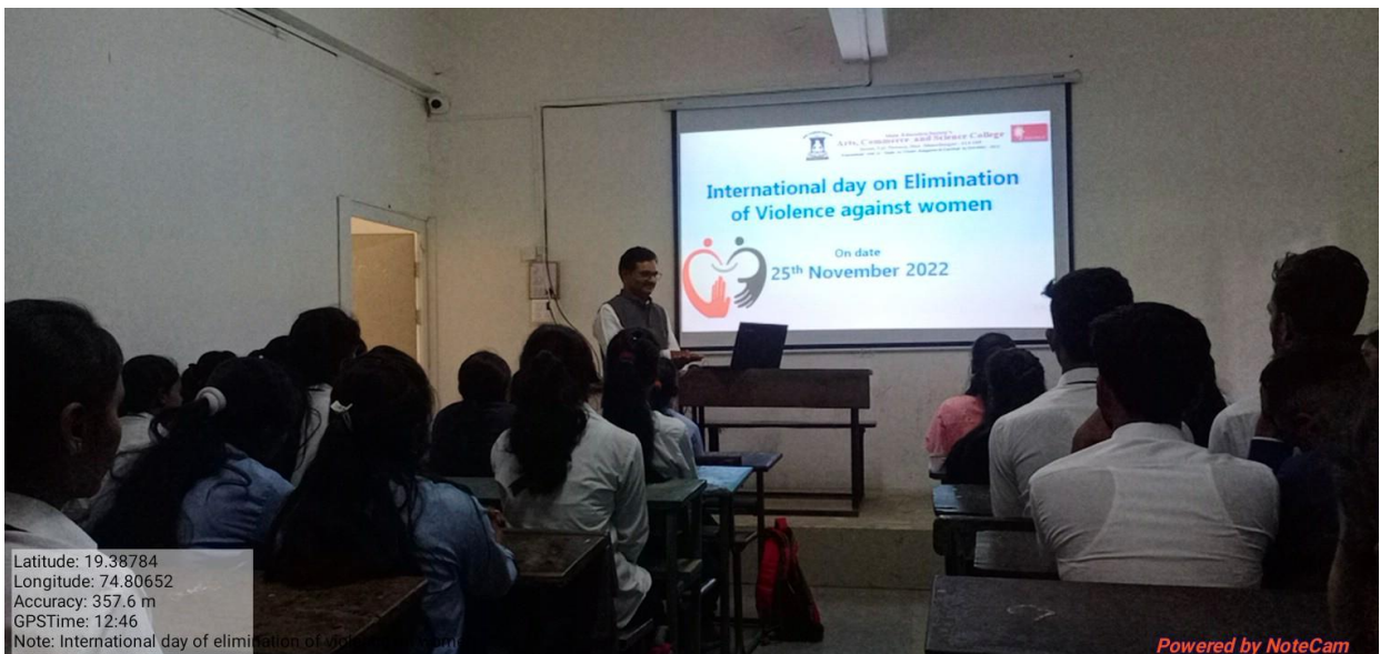
Figure 4 The Principal expressed the opinion on the society and women

Latitude: 19.38784 Longitude: 74.80652 Accuracy: 357.6 m GPSTime: 12:46 Note: International day of elimination of violence on wo