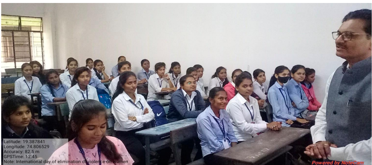
Figure 5 The principal expressed the opinion on the society and women

Latitude: 19.387841 Longitude: 74.806529 Accuracy: 82.5 m GPSTime: 12:45 Note: International day of elimination of violence on women