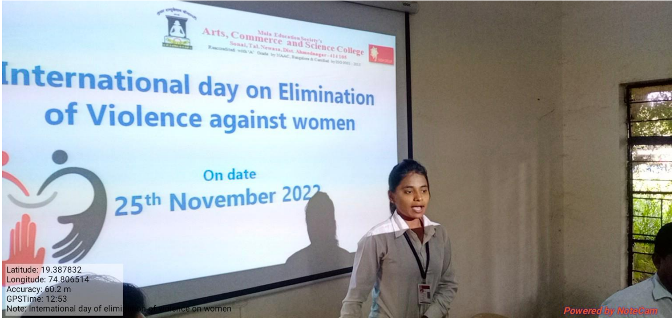
Figure 7 Oath to preserve social consciousness and maintain women's dignity.

Latitude: 19.387832 Longitude: 74.806514 Accuracy: 60.2 m GPSTime: 12:53 Note: International day of elimination of violence against women