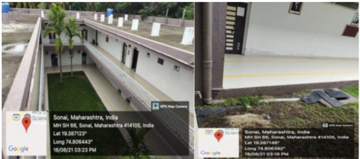
Rooftop Rain water harvesting unit installed in the science building

A rainwater harvesting system has been installed on the rooftop of science building.