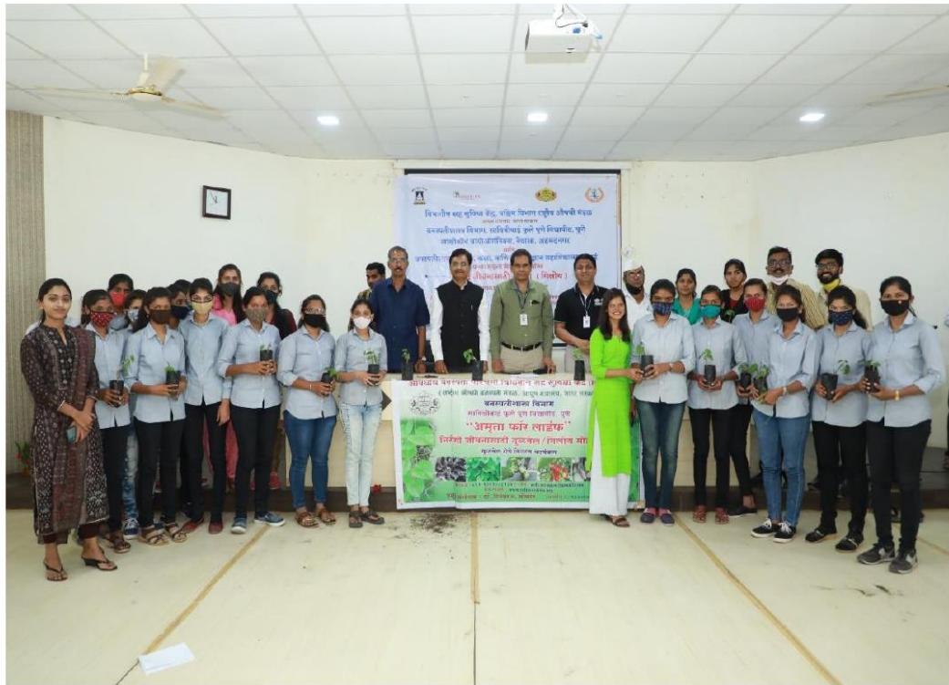
Environmental promotional activities