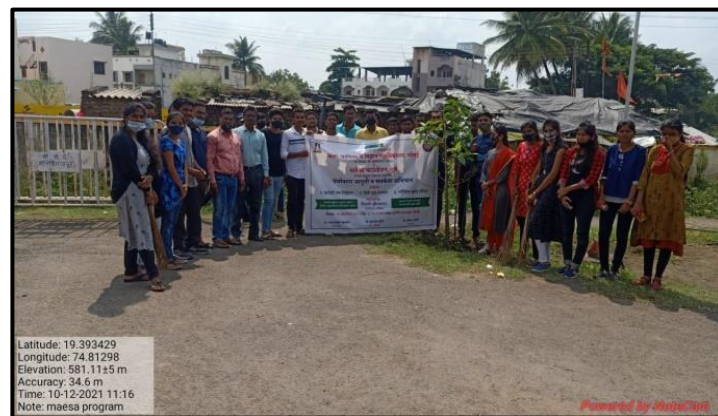
NSS volunteers participate in that activity, 12/10/2021