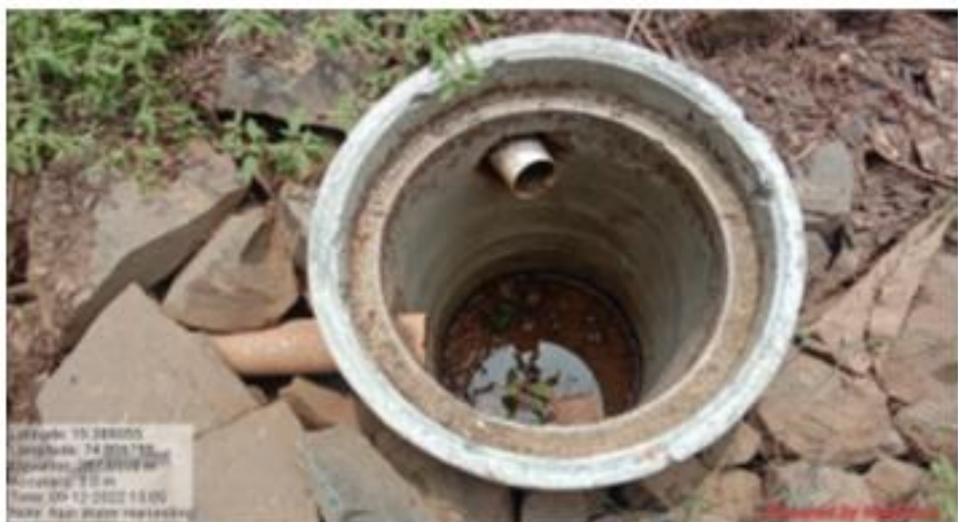
Ground Water recharge unit installed at the behind principal's office

The institution has installed two groundwater recharge units in the campus. The first unit