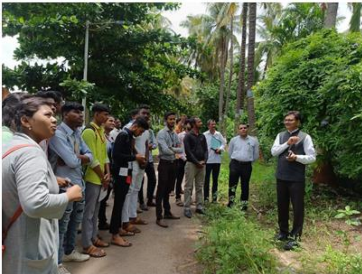
Biodiversity Walk in the college campus

In addition to this the following webinars have been organized in the institution to create awareness about environment in the students.