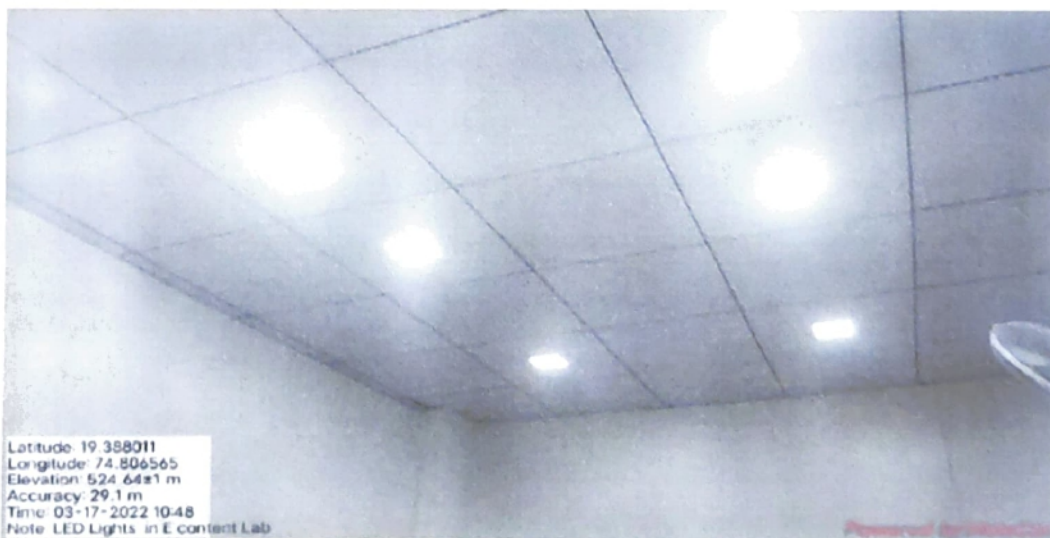
LED Lights in E Content Development Lab

All conventional bulbs and tubes which require high wattage, in the college, were replaced with LED lamps.