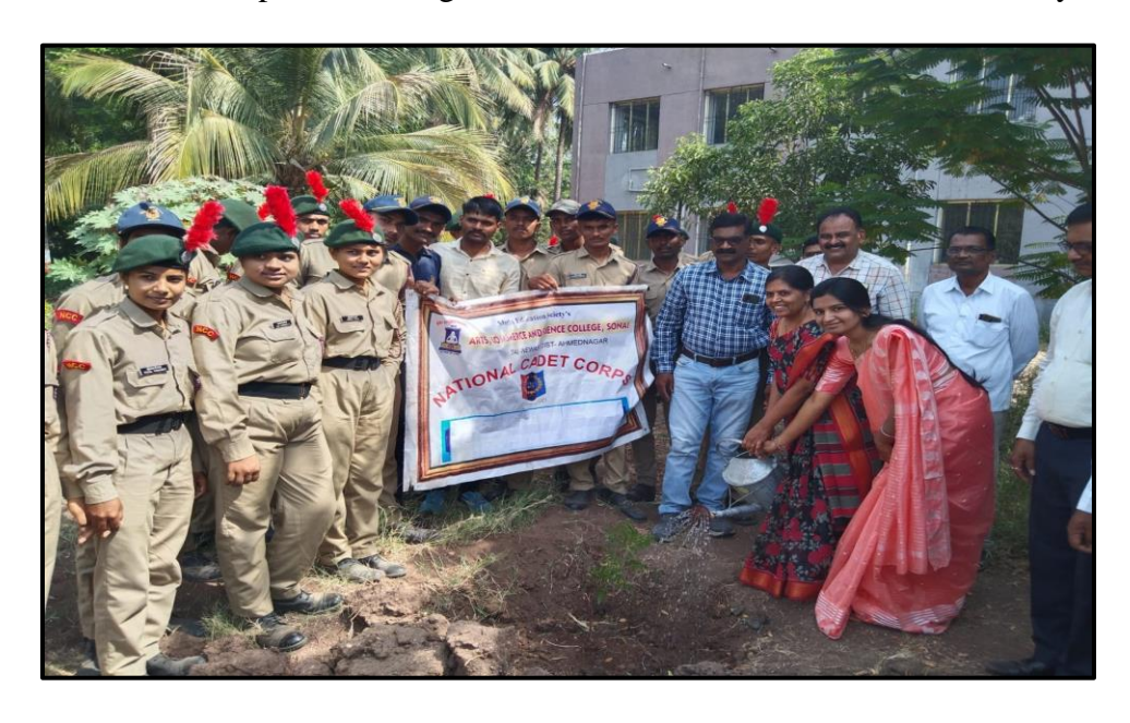
Tree Plantation by Chief Guest in College Botanical Garden