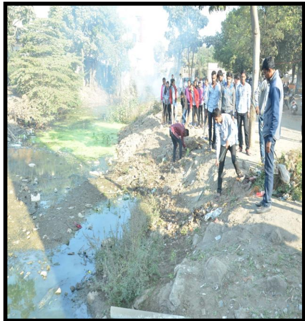
Cleanliness of Kautuki River by NSS Volunteers