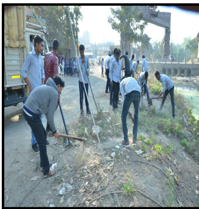
Cleaning of Kautuki River in Sonai by Alumni Students with NSS Volunteers

PRINCIPAL Mula Education Society's Arts, Commerce & Science College, Sonai, Tal. Newasa, Dist. A'Nagar-414105