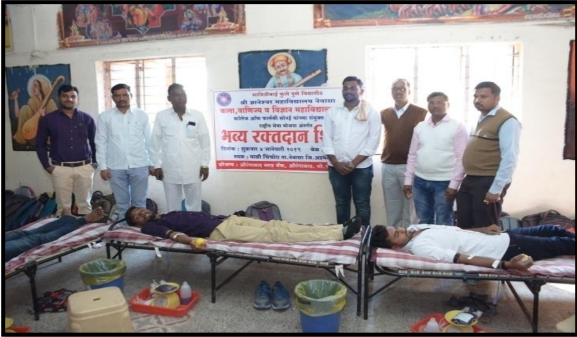
Participation of Alumni for Blood Donation Camp on date 20/01/2019