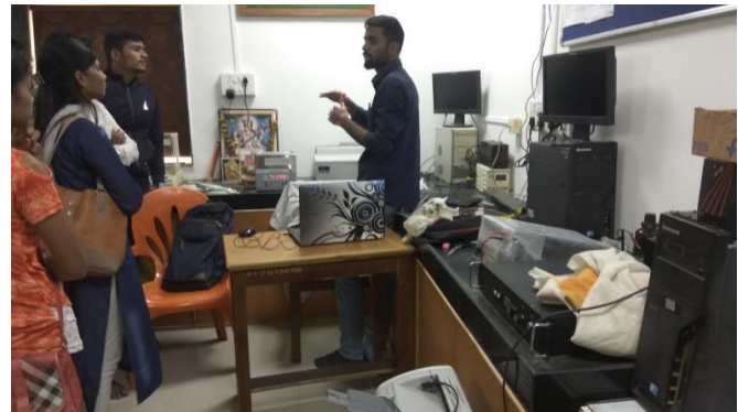
Visit to Department of Physics, Dr. Babasaheb Ambedkar Marathwada University Aurangabad