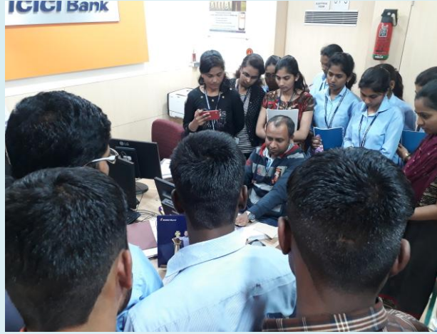
Students attending training at Class room as well as at branch